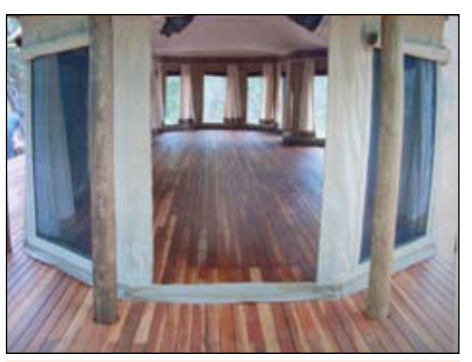
Tanzanian teak used in a decking application