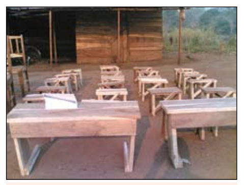
School desks and chairs manufactured and donated to schools in Mozambique by EAFP

allows for easy material handling both in getting the log onto the processing bed and during processing to rotate the log to avoid defects. This is especially important during the production of veneer cants.